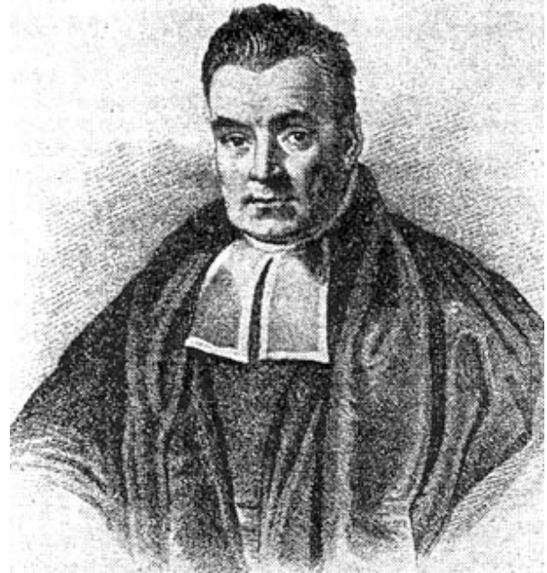
Thomas Bayes set out his theory of probability in 1764

Fortunately, just such a method was presented by Sturrock. 11 The ultimate application he had in mind was the UFO question: What is the overall assessed probability that UFOs are real (not man-made or natural objects)? Although the derivation of the approach involves Bayesian statistics, which can be daunting to non-mathematicians, the resulting equation that one can apply is quite simple. Sturrock presented the approach in detail, but did not attempt to answer the ultimate question in that paper!