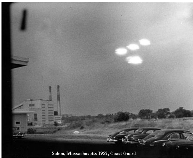
Salem, Massachusetts 1952, Coast Guard

In assigning a probability to (b), one doesn't explicitly take the number of witnesses who saw the same thing into account. However, the say-so of several such witnesses is almost always of more value than that from only one, so that one assigns a higher probability for genuineness (a value of p closer to unity) for multiple witnesses than for a single witness, if there is no reason to doubt their credibility. Their individual witnessings do not each receive separate p values, since in observing the same thing their data were not mutually exclusive.