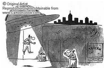
"You're just lucky I'm being abducted by aliens, pal!"

MS: Yes. He confirmed that Corso was legitimate by a retired US Air Force general who confided in him that Corso was telling the truth. Paul Hellyer hasn't revealed who that general was. People would like to know. But he is also being criticized, because just as Philip Corso was criticized, now Paul Hellyer is being criticized by many ufologists because he's taking Philip Corso at his word, or based on what he was told by the general.